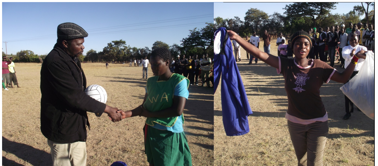
Honourable Dongo handing over prizes to Surrey farm netball team

The latest move by Zanu PF to clandestinely resurrect the notorious training centres behind the back of the Inclusive Government is a clear testimony that the party is not sincere in fulfilling provisions of the GPA.