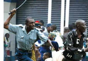
DIAMONDS AND CLUBS: The Militarized Control of Diamonds and Power in Zimbabwe

Marange was an irresistible draw for anyone with a brave constitution. It required no previous experience and offered the potential for quick and generous returns.