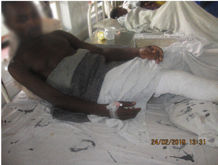
25 year old diamond digger at Mutare General Hospital. He was caught by Zimbabwe National Army soldiers on 15 February 2010 night digging for diamonds in the Chiadzwa area. He was beaten and suffered multiple fractures.

"Zimbabwe is not like Sierra Leone," one man explained. "The panners were not beggars. Many of them were professionals — teachers, lawyers, civil servants. Many had Master's degrees. They went to pan because the formal sector was disturbed. They did it out of pure economic desperation." 49