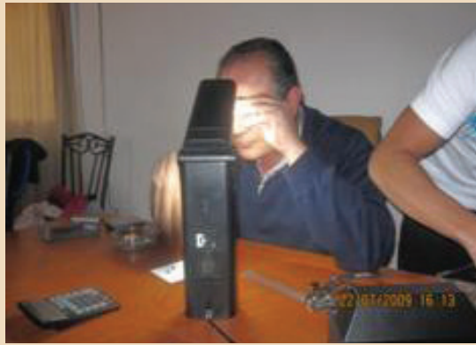
A Lebanese buyer inspecting Chiadzwa diamonds in Vila de Manica, Mozambique.

Instead he refers us to "Hussein", a 50-something Middle-Eastern man living in a newly built house removed from the main cluster of dealers. A new compact Hummer with Zimbabwean license plates is parked in the driveway. We are met by a burly bodyguard, and ushered toward a leather couch in his office.