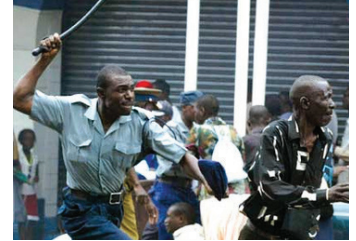
DIAMONDS AND CLUBS: The Militarized Control of Diamonds and Power in Zimbabwe

The Mozambique government should be requested by the KP and all of its participating governments to close down the Vila de Manica diamond-buying operations immediately.