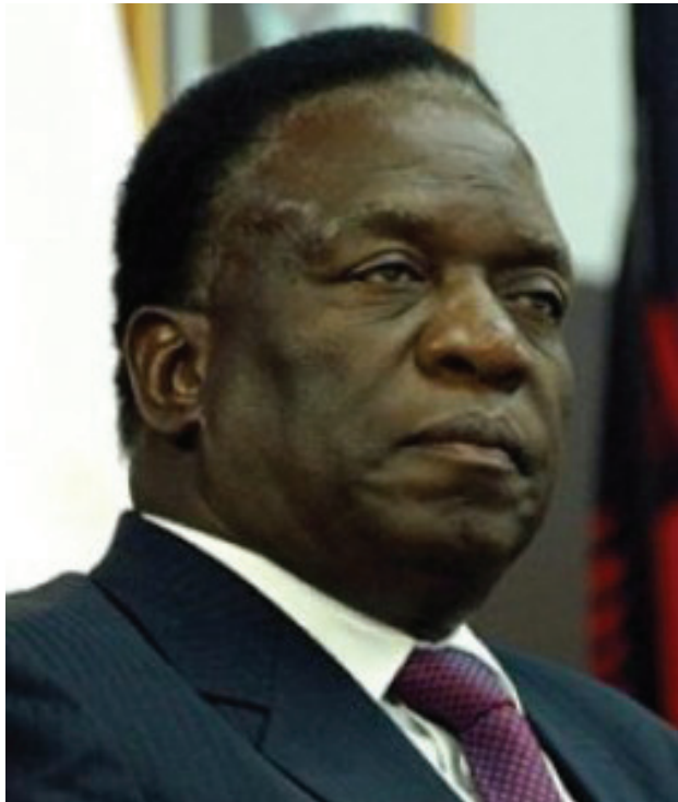
Emmerson Mnangagwa, Minister of Defence

But altruistic pretences were quickly shelved when it was discovered that Harare's intervention, like that of other countries, was motivated more by a desire to enrich itself on Congo's rich natural resources.