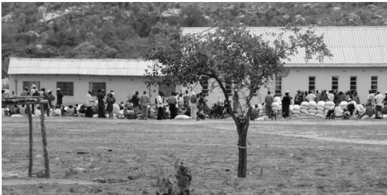
People wait in line to receive food aid.

food, and work: failure to ensure maintenance of the water and sanitation system leading to the outbreak of cholera; failure to ensure supply of water, electricity, sanitation, medical supplies, to hospitals, leading to shuttering of hospitals and lack of access to health care; the deliberate misrepresentation of information vital to health protection or treatment (e.g., the statistics of the cholera epidemic and the levels of malnutrition).