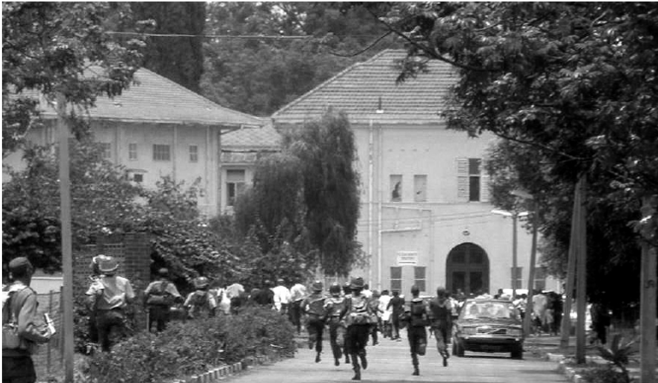
Police chasing health professionals at a non-violent demonstration.