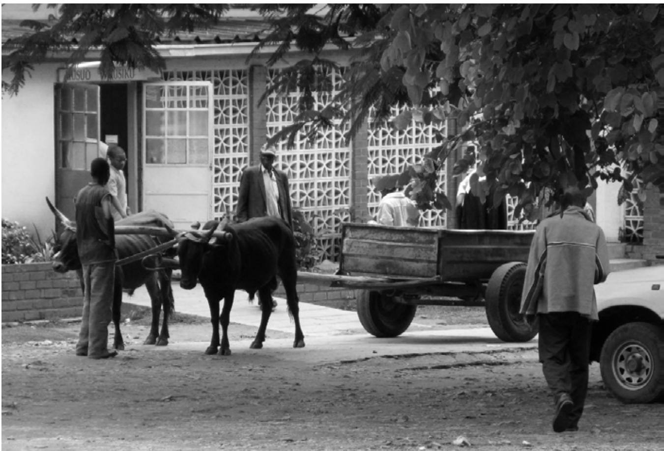
Oxcart used to bring a patient to a clinic.