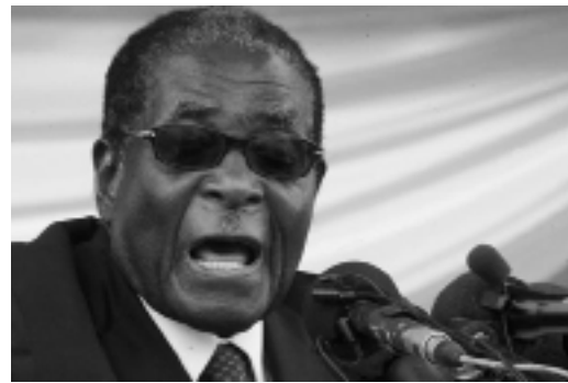
Zimbabwean President Robert Mugabe

The Zimbabwe Peace Project, a human rights coalition of local NGOs and faith-based organizations, recorded 20,143 incidents of human rights violations between January and September 2008 including: 202 murders, 13 attempted murders, 41 rapes, 21 attempted rapes, 411 cases of torture, 463 kidnappings