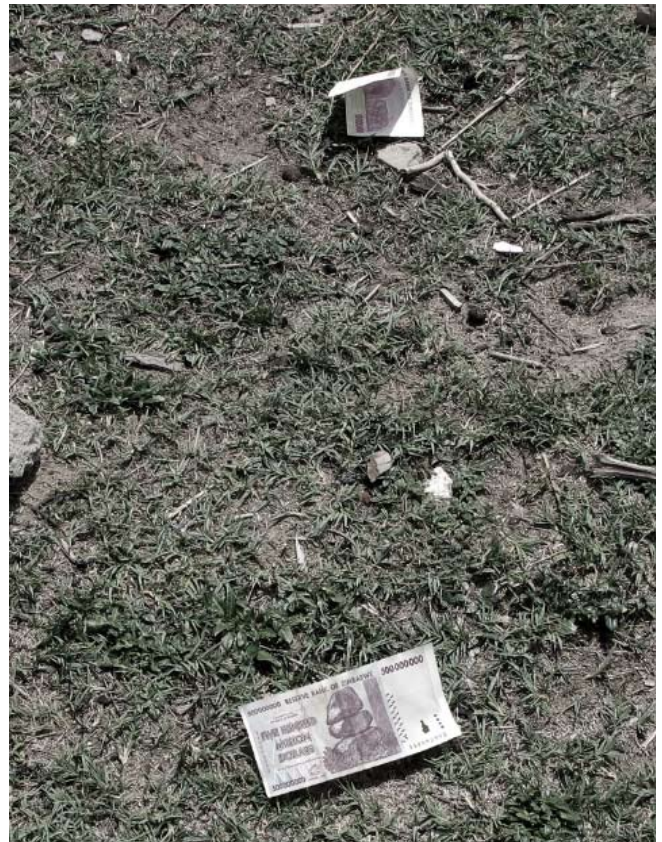
Discarded Zimbabwean 500,000,000 dollar bills.

2006, but the deterioration of both public health and clinical care has dramatically accelerated since August 2008.