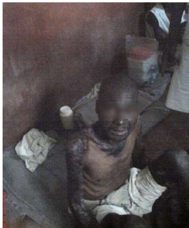
Man showing signs of Pellagra including dark, cracking skin in sun-exposed areas, and wasting. Photograph taken 5 January 2009 inside Harare Central Prison.