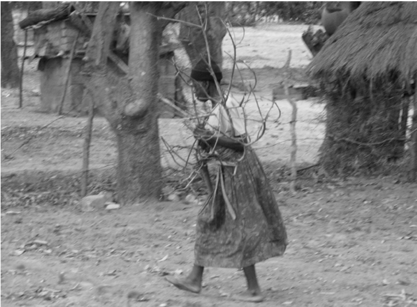
An elderly villager searches for firewood.